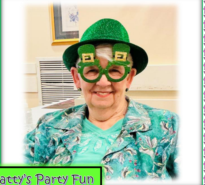
More Saint Patty's Party Fun